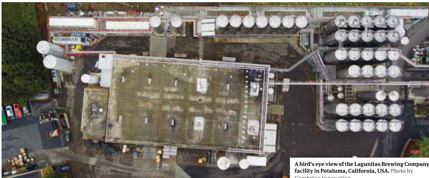
A bird's eye view of the Lagunitas Brewing Company facility in Petaluma, California, USA.

has a 98,420-liter (26,000-gal) central reuse tank that receives recycled water. The tank also has a backup connection to city water in the event that the RO system cannot produce sufficient water to meet demand. From this central tank, the recycled water is split and conveyed to two 98,420-liter (26,000 gal) point-of-use tanks. From these tanks, the water is disinfected by UV lamps to eliminate risk of contamination. The recycled water is then distributed by dedicated lines that convey the water to the actual point of use.